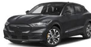
VIN# traced using AutoZone Lookup (Note: Mustang may be a different color. This is for informational purposes only.)

51. The Report then stated that Hisun appeared to have, according to Wolfpack’s findings, only one employee in the United States.